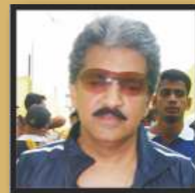
Anand Mahindra (for 'Nanhikali')